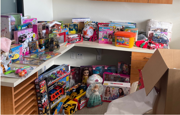
Above: Donations from last year's toy drive.

The holiday season is fast approaching. We are looking for new, unwrapped toys to give out to children served at the Family Justice Center. We are working with the Spark of Love program and will also be accepting donations through Amazon. For more information on how you can help please contact us at info@VCFJCFoundation.onmicrosoft.com .